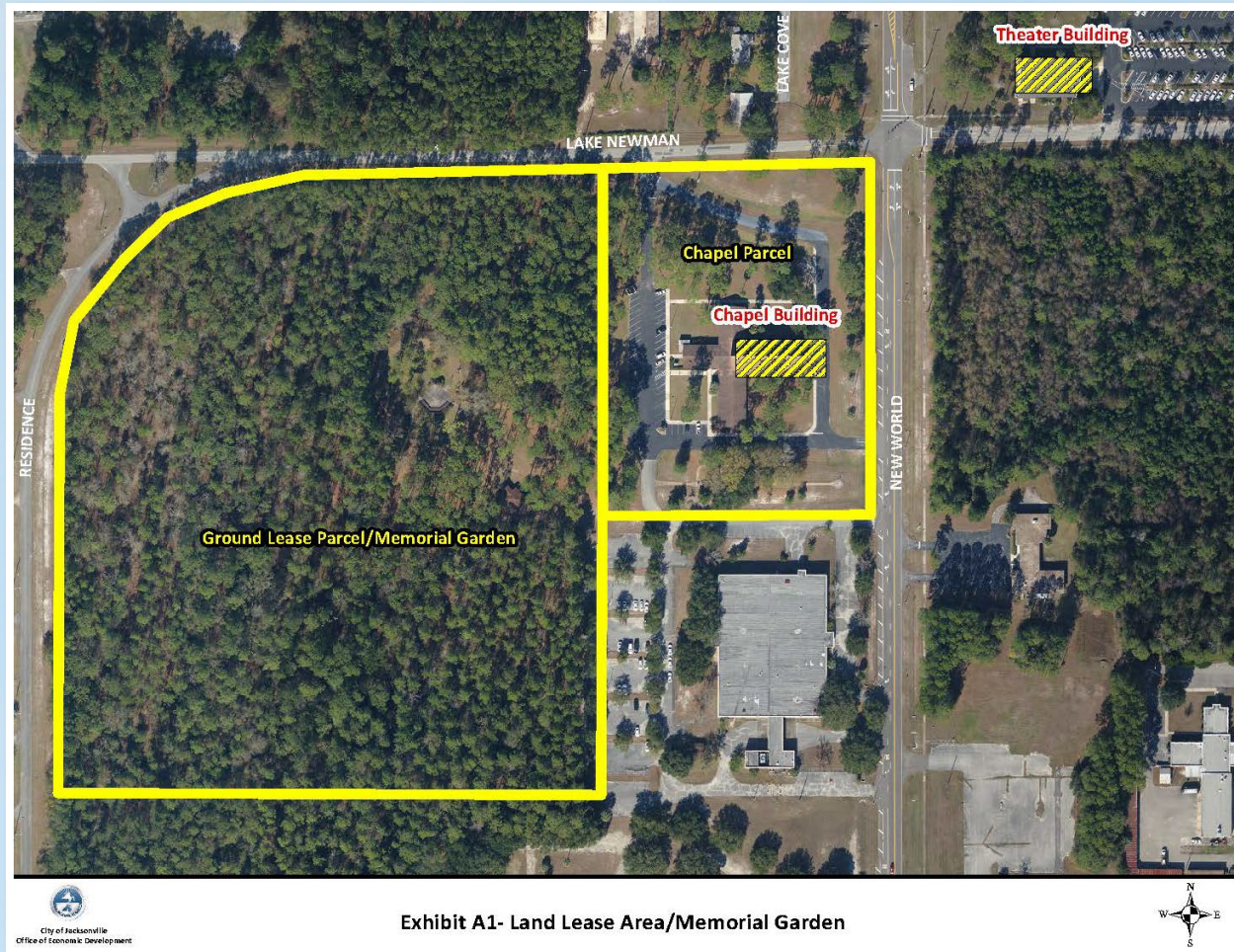
Exhibit A1- Land Lease Area/Memorial Garden